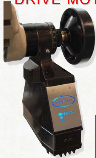
X,Y,Z Axis Servo Drive Motors